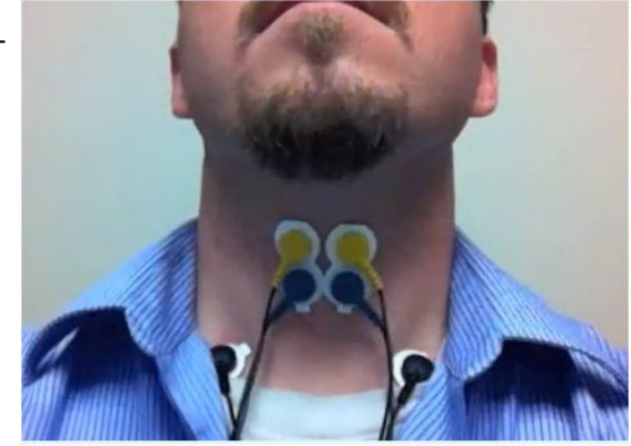
Figure 1— Electrode configuration for teaching the lower laryngeal position with EMG biofeedback.

The electrodes are attached to an EMG device (MyoTrac Infiniti, Thought Technology, Montreal) using sensor cables and the signal from the device is registered on a computer using specialized software (BioGraph Infiniti, Thought Technology, Montreal).